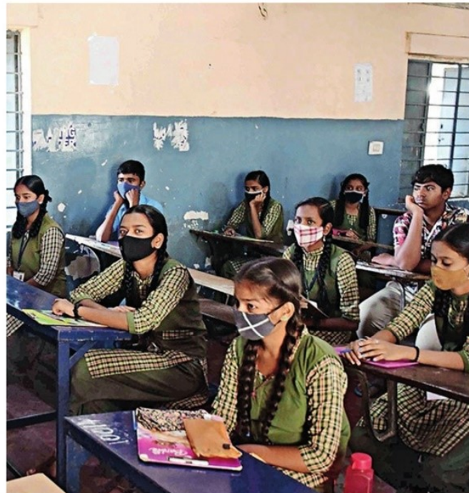
With offline classes in full flow, health experts say maintaining covid protocols on campus are key to battling covid

"In the first school, the team noticed that 31 students studying in sixth standard were suffering from Covid symptoms. Hence, the staff subjected them to on-the-spot RAT and all of them tested positive. Later, their samples were sent for RT-PCR testing. In the second school, 21