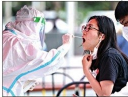
TEST & TRACK: A woman gets tested for Covid in Beijing

Authorities announced on the weekend a "ferocious" Covid outbreak linked to the