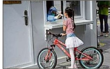
A health worker takes a swab sample from a girl in Beijing.

Besides Indians, the Chinese Embassy in New Delhi said family members of Chinese citizens and foreigners with Chinese permanent residence permits going to China for family reunions or visiting relatives can apply for visas. Many Chinese employees were also stranded in