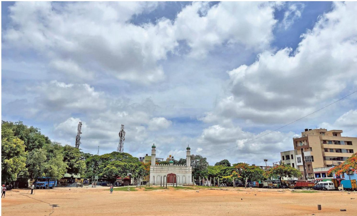
BBMP ordered that status quo should be maintained on the property until a report is submitted by the legal cell of the civic body. ■ FILE PHOTO