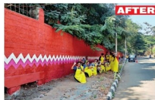
The entire wall of the Rashtriya Military School has been beautified by volunteers of TUI