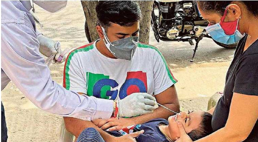
Once under Integrated Disease Surveillance Programme, monitoring of COVID cases will be similar to that for other communicable diseases.

This is to be done irrespective of whether the city witnesses a surge or not