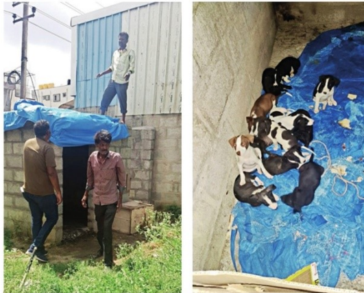
Rapid development has resulted in lack of space for these pups to coexist. Although temporary shelters are made, they are in dire need of a home

Animal lovers manage to rescue 14 puppies from the jaws of death