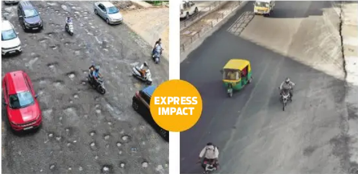
(Left) The pothole-riddled Mysuru Road; All the potholes have disappeared after BMRCL fixed the road