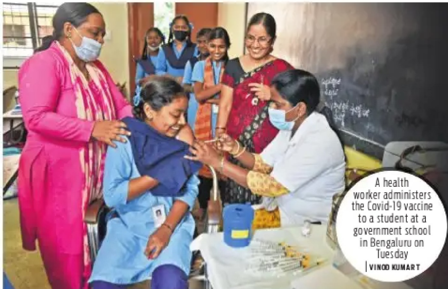
A health worker administers the Covid-19 vaccine to a student at a government school in Bengaluru on Tuesday

The vaccination team visited the schools on June 9 and found a few students to be symptomatic. When RAT was conducted, they tested positive. Since it was a cluster, the samples were subjected to RTPCR tests. P3