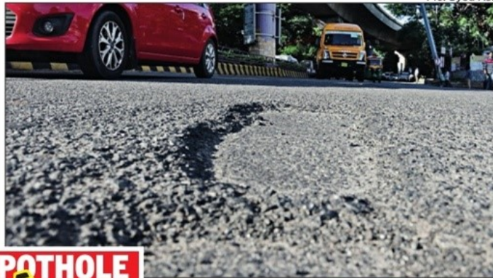
Pic: Syed Asif